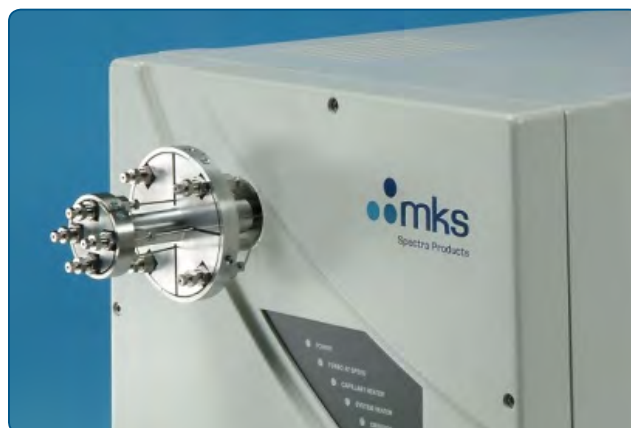
Eight way multi-stream inlet option

The Cirrus 2 vacuum system utilizes a high compression turbomolecular pump so light gases such as hydrogen and helium can be sampled with no additional expensive pumping requirements.